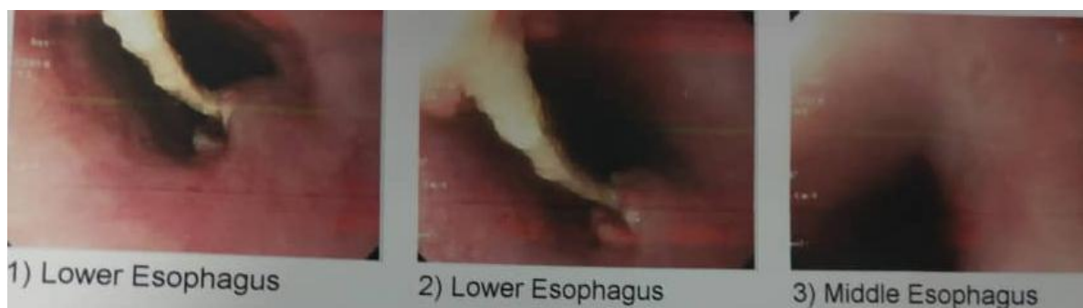
Figure 2. Endoscopic image showing a sharp chicken bone penetrating the esophageal walls