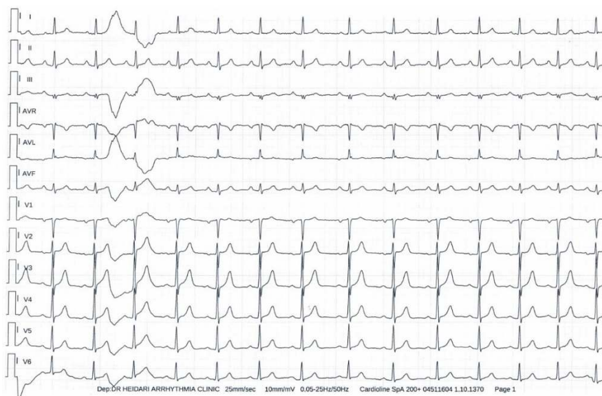
Figure 3. Electrocardiogram after Ledibiox withdrawal