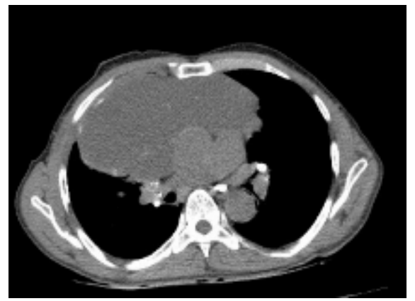
Figure 1. None contrast CT scan. A huge hypodense mass in middle and anterior mediastinum with foci of calcification.

anterior mediastinum adjacent to the heart and great vessels (Figure 1).