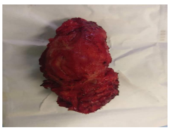
Figure 3: Chondroblastic osteosarcoma macroscopic sampling