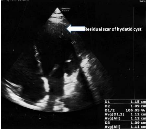
Figure 2: Follow up echocardiography showing residual scar of removed hydatid cyst.